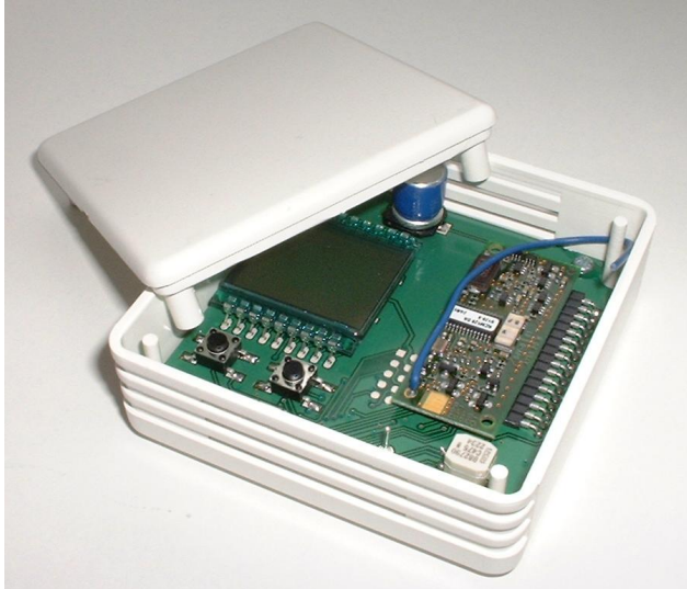
Figure 1: Gateway

SRC-KNX/ENO acts as a gateway between EnOcean radio sensors and the EIB/KNX bus. It has 32 channels, each of which can be configured with one of the following functions: